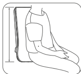
Stand by button